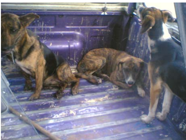
Three, of the many, homeless dogs